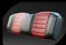
Two tone seat