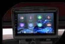
9 inch touchscreen with back-up camera