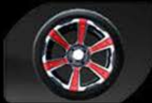
14" Alum Wheel with black insert/215/35R14 Radial DOT Tire