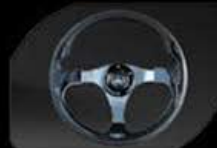
Luxury steering wheel